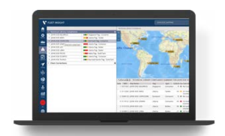
Image below: Systematic identification of products each vessel in a fleet needs using Voyager FLEET INSIGHT. Publications missing from vessel holdings and required by regulators or ship cos own requirements are clearly flagged.

These sorts of data led tools are saving shipping company's money while also helping to improve overall safety and compliance across fleets.